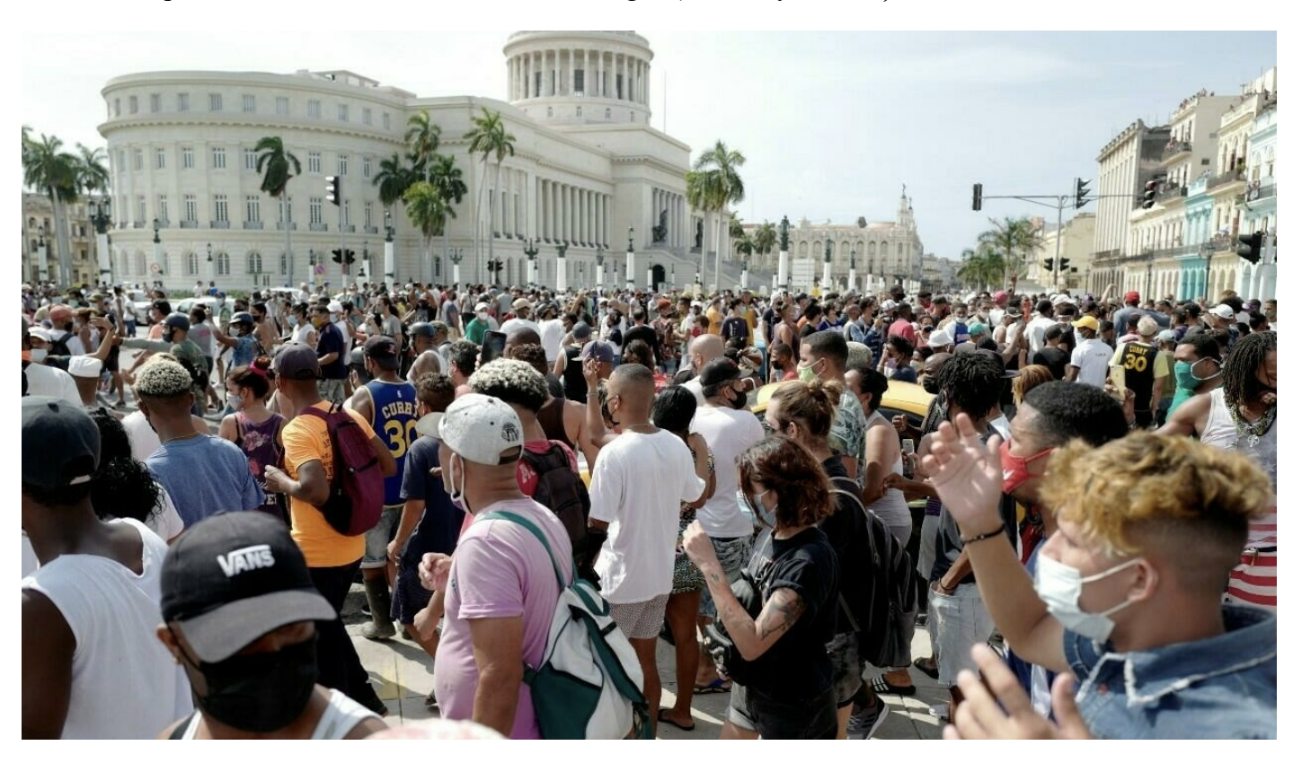
July 11th protests signal a heroic rebellion and commitment to freedom

The people's protests of July 11th, 2021 were a massive rebellion of the Cuban youth heartened thru the internet in a patriotic demand for "freedom and change" (libertad y cambio).