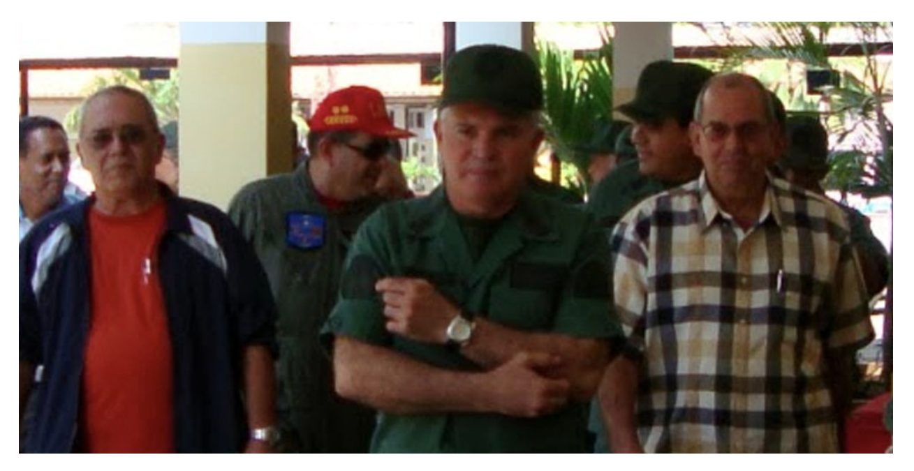
General Andollo (red t-shirt) with Cuban officers in the Maiquetia airport (Venezuela)