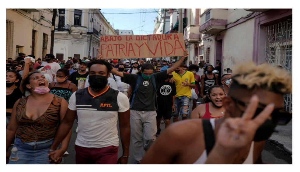
Image of the massive protests where thousands of Cubans marched throughout the Island during July 2021, demanding freedom.

It seems that the July 11 massive mobilization of protesters was galvanized by social media. The Cuban military response is to stifle and control the internet networks.